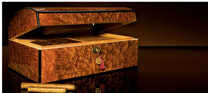
As seen on Robb Report: 100-cigar curved-lid Signature Treasure Chest humidor with rounded corners and

After the initial quality check, they are left to age an additional year before they are released to the market. This ensures a ready to smoke cigar right out of the box with little to no inconsistency from smoke to smoke.