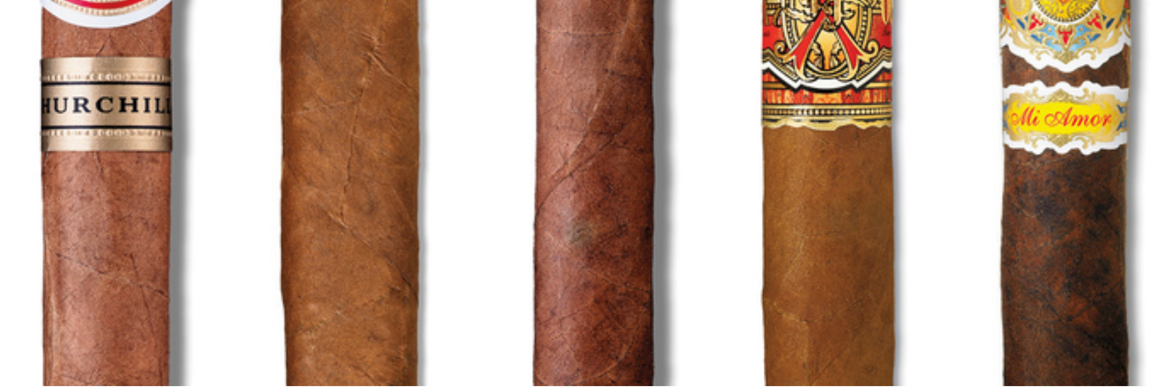
Five Great Cigars For Valentine's Day