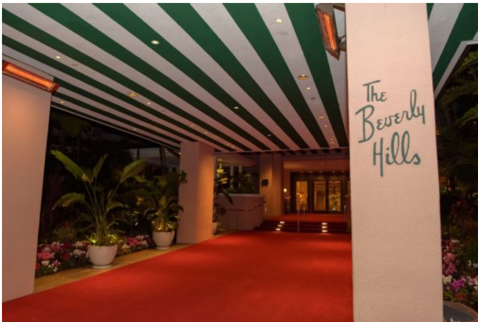
The Red Carpet