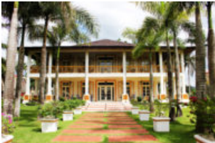
CIGARS ProCigar Recap: Day 5