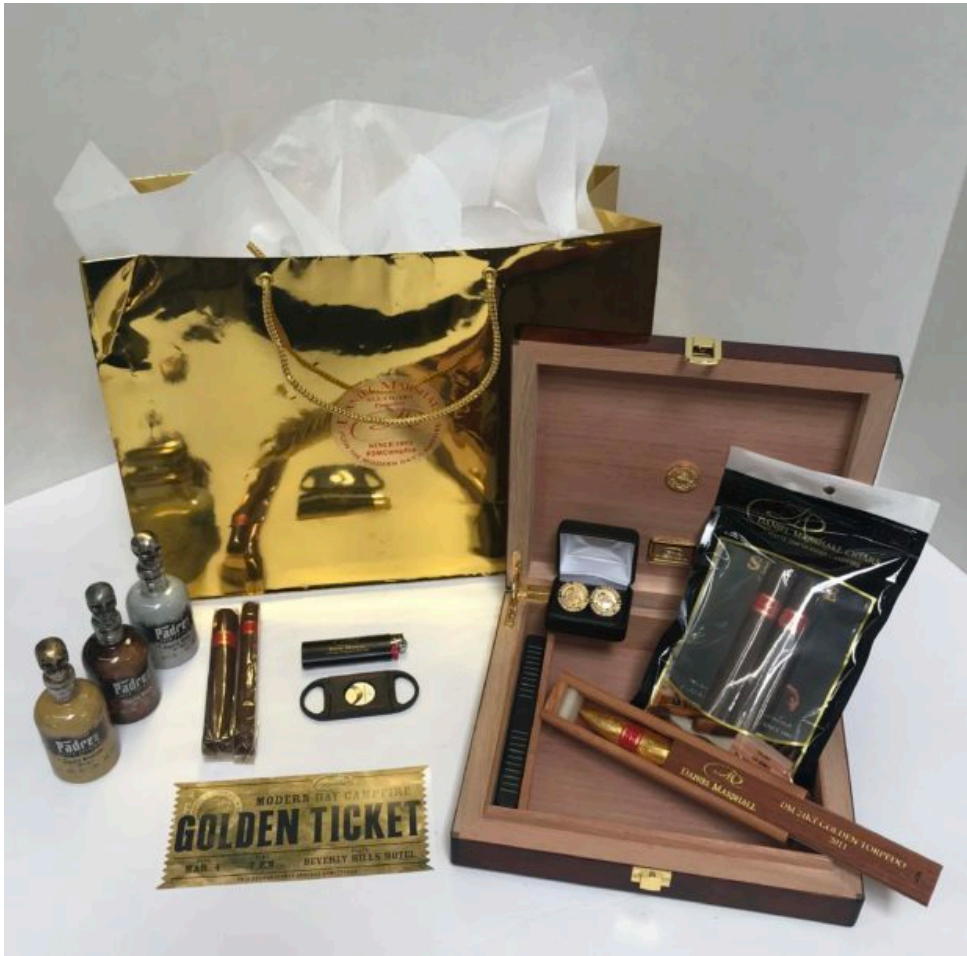
PR Golden Ticket Treasure Trove

Golden Ticket holders were impressed at the value they received upon discovering the golden bag on their seat that was filled with a treasure trove from the DM Collection. The value of the DM Desk-Travel Humidor in Burl ($400) and the famous DM 24kt Golden Cigar ($295) exceeded the $475 price paid for the Golden Ticket. A 750ml bottle of Padre Azul Anejo Tequila ($100), a set of Golden DM Cufflinks ($50), 4 – Cigar Aficionado 92 point rated DM Cigars, dinner, and fine spirit tasting caused those that did not pre-purchase the Golden Ticket, regret since they did not take advantage of the spectacular $1200 value. Every guest received at the conclusion of the evening two DM Red Label Robustos, a 50 ml bottle of Padre Azul, complimentary membership in The Daniel Marshall Campfire Club (DMCC) with benefits including exceptional offers and 1 st ticket priority to all future Modern Day Campfires.