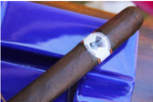
CIGAR OF THE WEEK Profile on Stroker Stogies